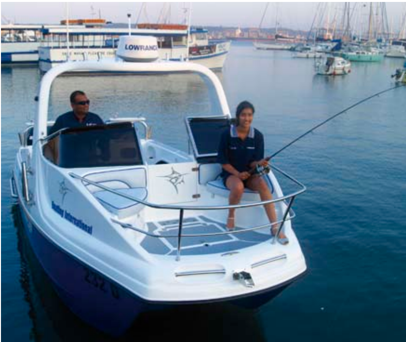
Forward seating in front of the consoles is comfortable and easily accessible – great for parking off and casting your rod.

Thanjan for forging ahead in developing this new model. The 630 adds yet another arrow to the bow of Boating International's impressive range of new water craft.