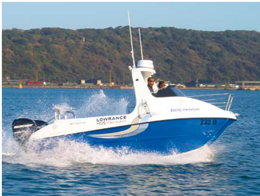
Twin 115 HP Mercury Optimax motors, renowned for their reliability and efficiency, clocks 71 km/h on the water and planes in a flash.

This boat featured twin 115HP Optimax Mercury outboard powerplants. These