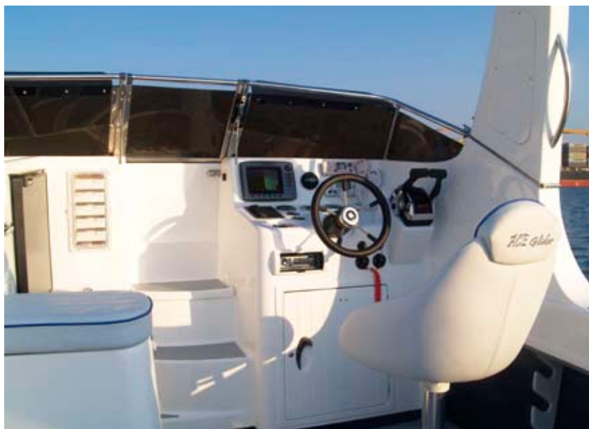
The cleverly-designed helm area with adjustable skipper's chairs and an array of instrumentation will certainly keep you entertained.

well proven, economical models – 1 526 cc each – are extremely quiet. Two four-blade stainless steel propellers were fitted at 17-pitch – giving maximum revs per minute of 5 800.