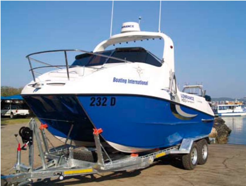
The Ace Glider 630's sleek design, modern, streamlined contours and radar arch certainly makes one sit up and take notice!