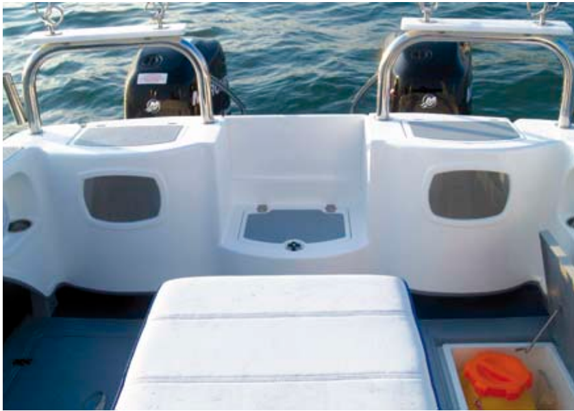
With multiple rocket launchers and live bait wells situated at the stern, she's a craft designed for the serious fisherman.

cans may be the safer option for game fishing, considering the mileage one might clock up trawling, as economical as the motors are!